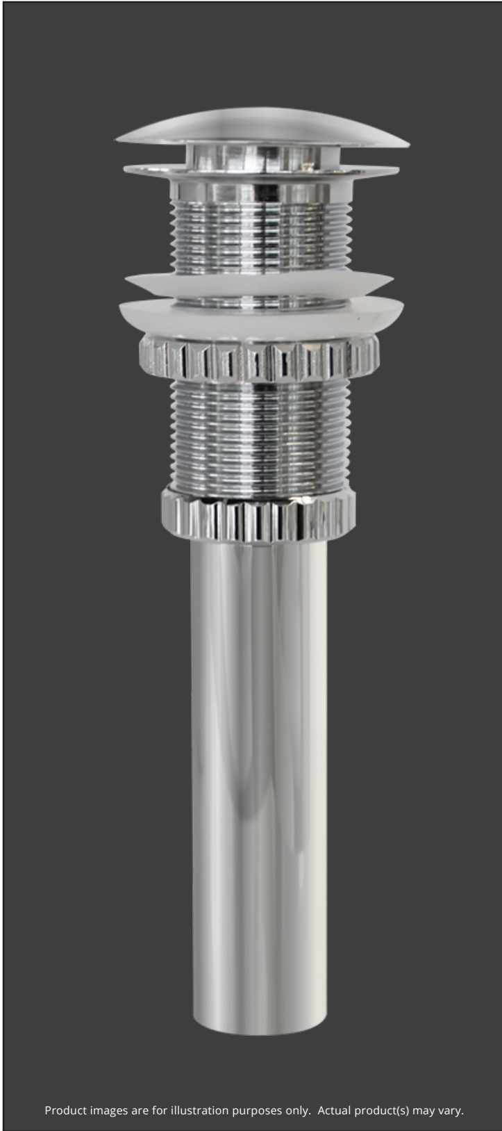
Product images are for illustration purposes only. Actual product(s) may vary.